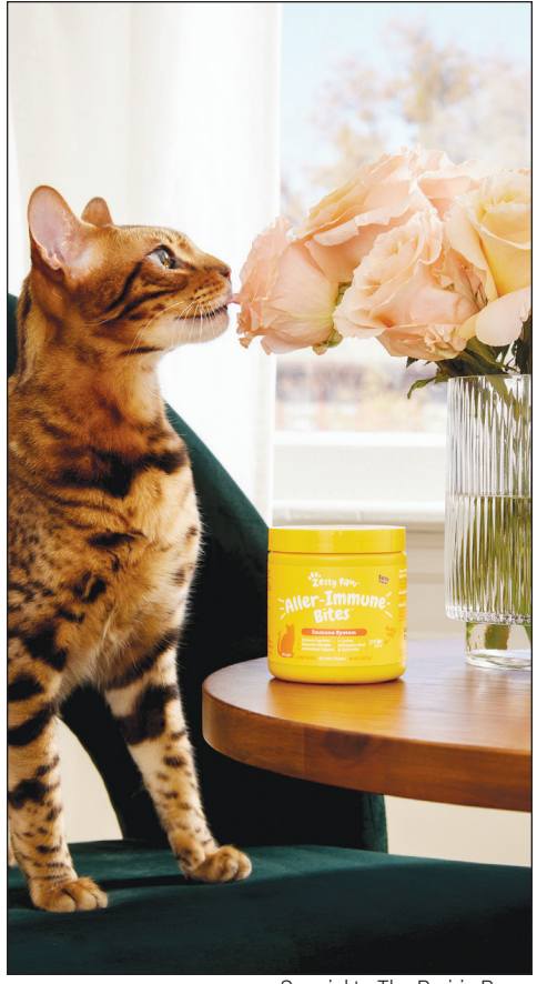
Special to The Prairie Press

Once temperatures start to rise, the tiny, creepy critters start crawling. Fleas, ticks and other pests can cause serious health concerns for pets. This spring, make sure your pest control programs are primed and ready for added protection. Talk to your veterinarian about the best routine and products for