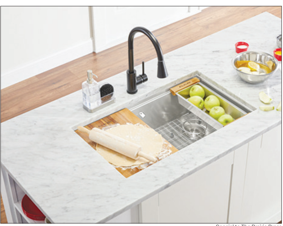
Special to The Prairie Press