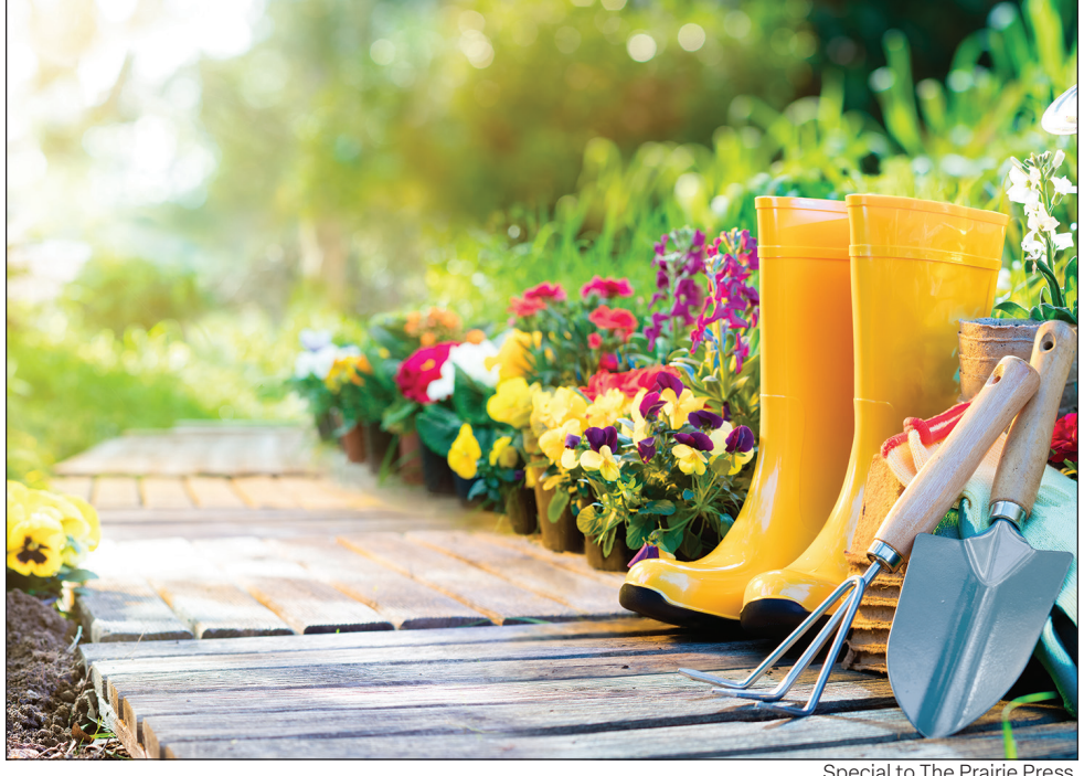
Special to The Prairie Press

Understand the importance of quality soil. You may think any dirt will do, but keep in mind the soil you plant in will be the primary source of nutrients for your produce. Not only that, but quality soil provides stability so plants can root firmly and grow healthy